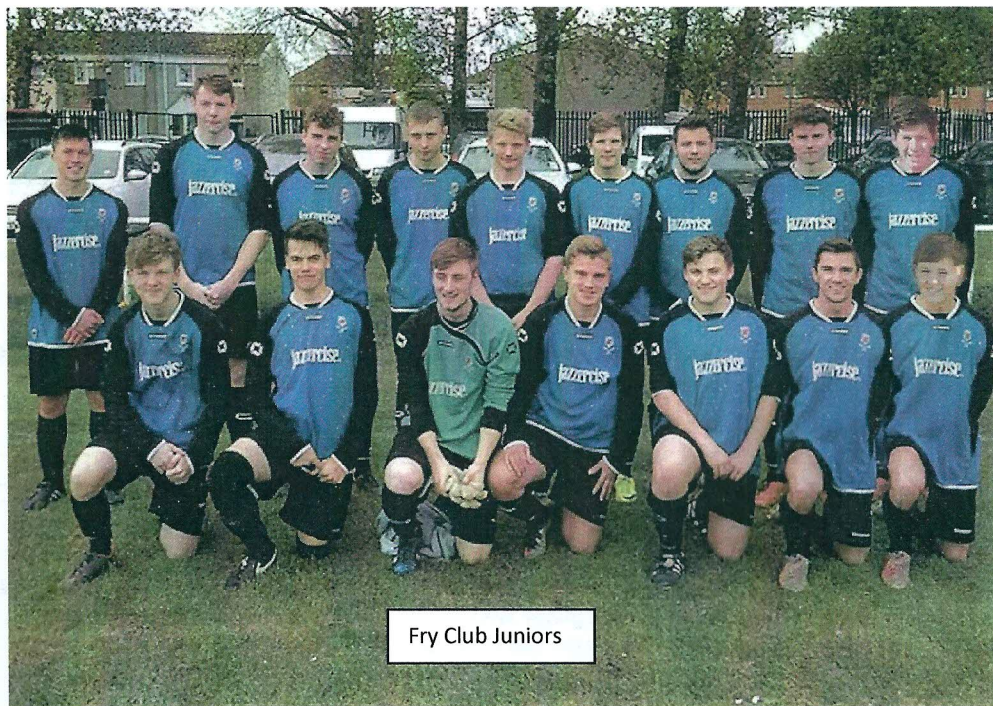
Fry Club Juniors