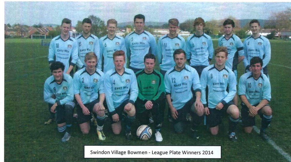
Swindon Village Bowmen - League Plate Winners 2014