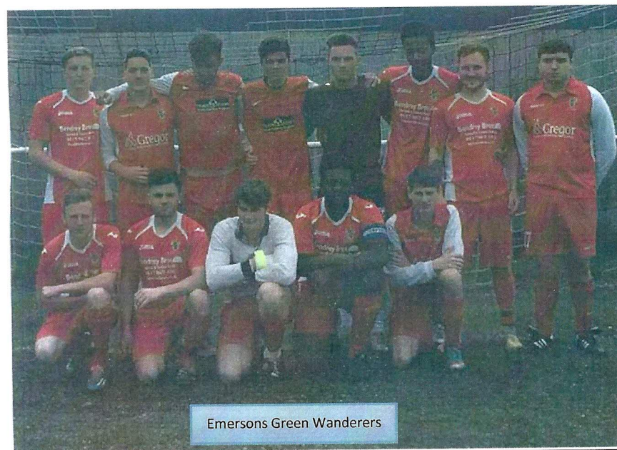
Emersons Green Wanderers